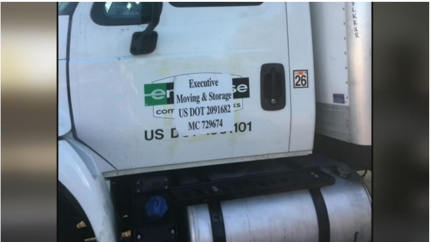
The rental truck had a piece of paper taped to it saying, "Executive Moving and Storage."